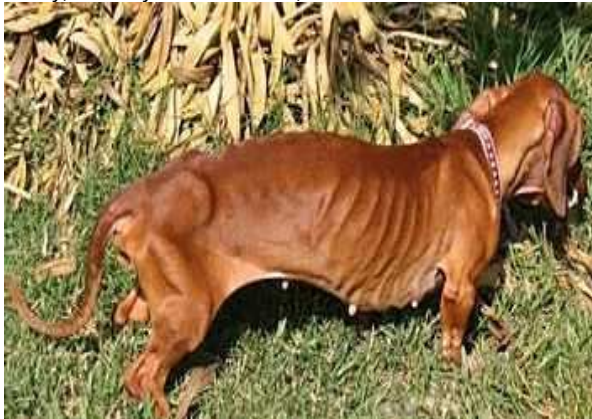
Pandy, courtesy of rescue mom, Janis

Untreated or misdiagnosed dogs with EPI, may die a painful death either by starvation or organ failure.