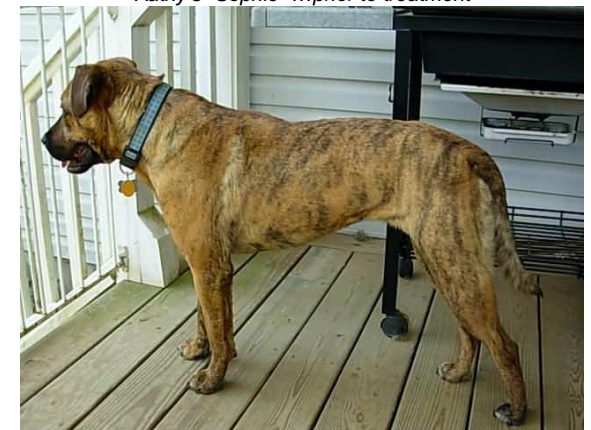
Kathy's "Sophie" ...45 days after treatment